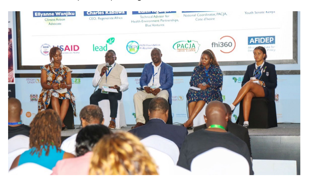
The main outcome of the Africa Climate Summit (ACS) was the Nairobi Declaration.

The panel discussions that led to a Q&A session saw audiences give their insight on how climate change affects vulnerable populations with adolescent girls' menstrual needs being highlighted. There was also a cry to ensure that when talking about climate and health, mental health issues are addressed. There has been an open call for partners and governments to incorporate health into the climate discussions as the climate change being experienced impacts on the health of people. This hopefully will come out clearly at the upcoming COP28 in Dubai.